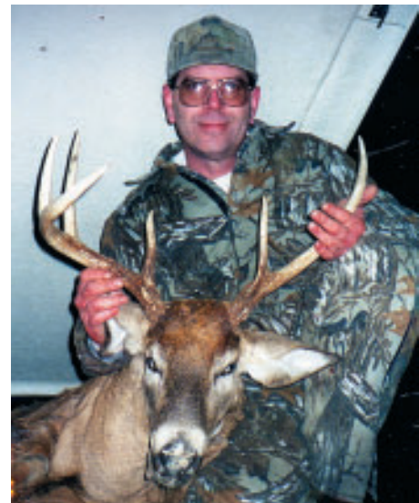
I think the grin says it all about this Dandy Buck checked in at Tomlinson's Shooting Supplies Inc.

Backwoods Preserve (574-633-4406) was established in 1999. They offer Pheasant, Chukar, Deer, and they also have exotic hunts for Ram, Russian Boar, Fallow Deer, and Black Bucks, Elk, Sika, Buffalo, African game and much more. Bird hunting has been going very well and they expect a successful season with congratulations to all of the area hunters. Check out these Bird Specials for 2011, you can release either 5 Pheasants or 8 Chukars for only $100.00. They also have a Guide and Dog available for only $60.00 per party. Be sure you take advantage of these GREAT PRICES and their Fast Flying Birds and Excellent Cover. This is a hunt you will fondly remember for many years. Your stomach will also thank you for the Delicious eating. You may hunt with archery, shotgun, handgun, and muzzleloader in the proper seasons and they have European Hunts available for 8 to 20 shooters with lodging and transportation options available. Call or visit them at their website www.backwoodspreserve.com for prices and additional information. Call your hunting buddies today, pick a date and book a hunt you will cherish forever. This would be a great way to break your son or daughter into either bird hunting or Big Game hunting.