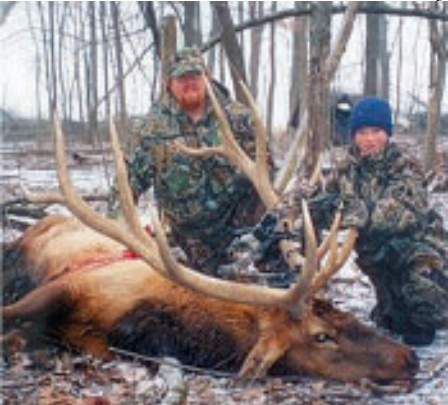
Trophy Elk in Northern Indiana? Yep! Backwoods Preserve, Bremen.

Browning Safes Deer Check Station (260) 693-2830