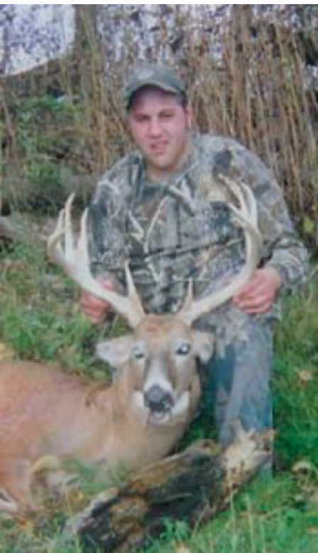
This BIG buck was taken by this happy hunter. This Monster Buck was taken with a Bow and checked in at Hard Nocks Archery