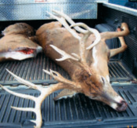
HOLY MOTHER OF MERCY !!!!! Look at this MONSTER TROPHY Buck that was checked in at Tomlinson's Shooting Supplies, Inc.