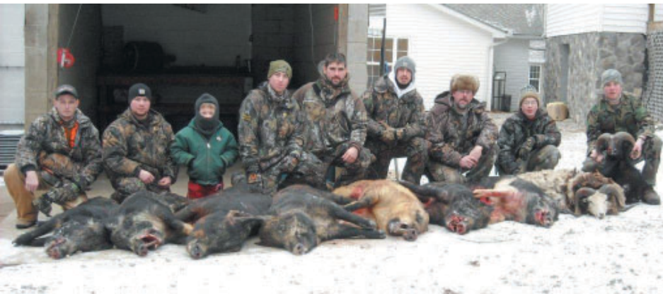
This HAPPY group of hunters had a GREAT Hunt at DD Ranch. Call your hunting buddies and book a hunt today.

would like to hunt, give them a call at 740-596-7411 or email them at dannie@DDRanch.com . They can make certain to have it on hand for your once in a lifetime hunting experience.