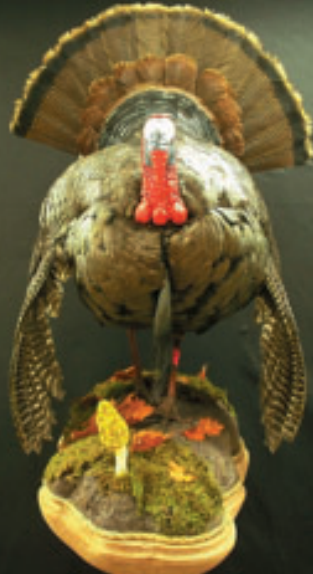
This beautiful turkey mount was created by Elkins Quality Taxidermy & Deer Processing.