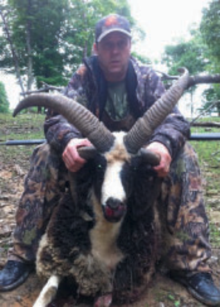
This HAPPY hunter had a GREAT Hunt at DD Ranch.