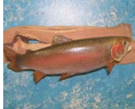
What a Beautifully displayed Rainbow Trout.

•Deer •Fish •Birds •Bear •Big Cats •Exotics