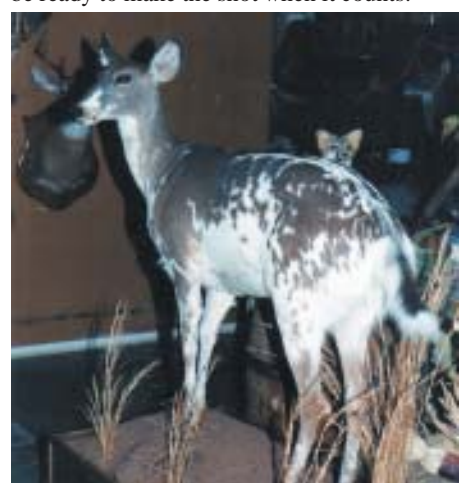
Harvesting a piebald deer calls for a beautiful full body mount like this one, done by Spencer's Taxidermy in West Hamlin.