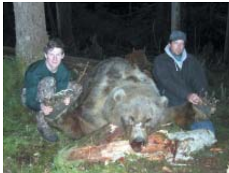
These two fellows were calling elk in Saddle Hills south of Woking, Alberta when this big guy slipped in on the caller.