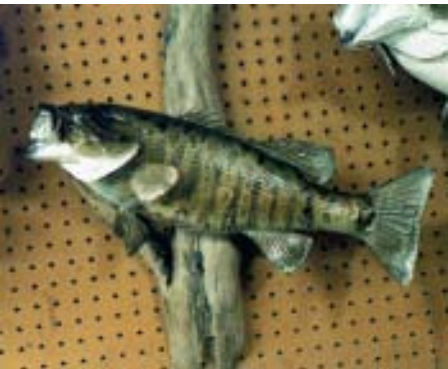
What a nice display of a fine bronzeback.