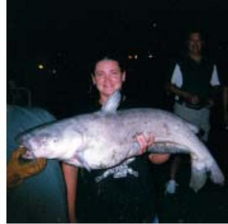
This angler holds up a 39 pound blue cat, a tournament winner at Wilson Run Pay Lake and Carry Out.