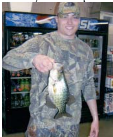
This is just a Sample of the GREAT Crappie fishing at Paint Creek.