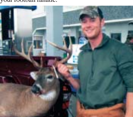
This is a Sample of the Trophy Bucks that are checked in every year at Rocky Fork Truck Stop.

While you are at Hall's Garden Gate be sure you check out their Own Delicious fresh squeezed Apple Cider, Amish Baked goods and Pies, Amish Cheeses, Large Deli with great sandwiches. They also carry a HUGE selection of Garden Supplies, Mums, Fresh Produce and plenty of Pumpkins for the kids to look over to find their favorite. Remember to check out the Large selection of Wines. They even have carry-out beer. Hall's Garden Gate also carries a BIG selection of Ohio State , michigan, Steeler and browns Products. I'm sure you can find something for your football fanatic.