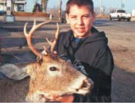
The hunting is always good in the Rocky Fork - Hillsboro Area.

PARAGON INN (U.S. Rt. 50), 883 W. Main St., Hillsboro, OH Phone 937-393-4730 , Fax 937-393-8166