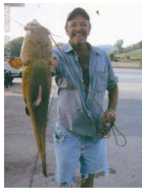
This Dandy 19 lb. Shovelhead was caught on 8-24-11 at Paint Creek.