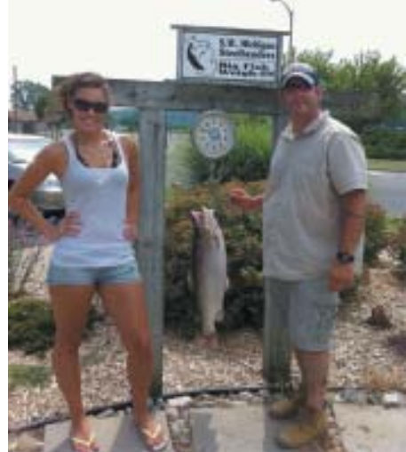
This happy angler caught this 16lb., 8 ounce brown trout on 7/19/11 trolling St Joe.

Give us a call, send an email or just stop by for the latest and most up to date fishing info.