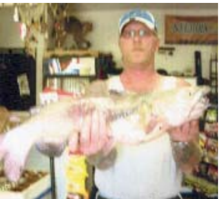
These two "good-eatin'-size" walleye were caught in the Upper Huron River on June 17, 2011.

Jamie at Jeff's Bait & Tackle (734) 289-4901 reports that walleye were hitting in the River Raisin channel in 18 to 25 feet of water and at Bell Buoy area (in the Detroit River) in 15 to 25 feet of water. The hottest colors for crawler harnesses & spoons were (.. and we're not making this up...): Copper boy/girl; "Snatch" 1 & 2; Copper scale; Silk panties; Greasy chicken; All oil slick and red huckleberries! Perch were really hitting at the Onion, West sail and S. Dumping grounds and also in 26 feet of water off Stoney Pointe.