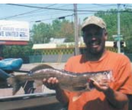
Another happy Grand River Bait and Tackle customer with his trophy caught near Dietrich Park on the Grand River.