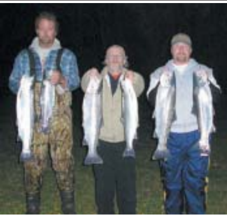
This happy group of fishermen stayed at the Lake Shore Motel.

Don't forget, The Lake Shore Motel is conveniently located with a full view of Lake Michigan. They also have a fishing pier that is in walking distance. They have Clean rooms, fish cleaning with freezing, a housekeeping unit and a gift shop. They also have a clean cabin to sleep four with all the conveniences of home for rent. They even offer a Special Price for us fishermen. You can call (231) 723-2667 for reservations.