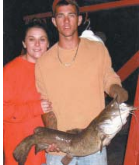
This happy couple caught this 21lb. Shovel at Sportsman's Paradise. I'm guessing she caught it and he had to carry it up to be weighed.