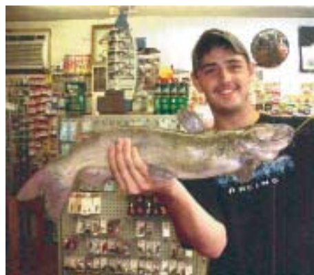
This Little Dipper customer landed a nice 9-pound catfish while fishing at Huroc Park on 6-23-11.