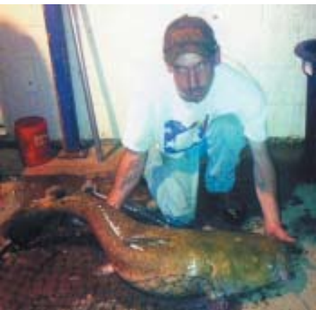
This dandy 48.4lb Shovel was caught at Tanglewood Pay Lake on 06/07/11.

24 Hour Live Bait & Tackle Vending Machine