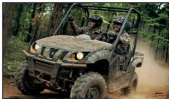
2009 RHINO® 700 FI AUTOMATIC 4x4

To experience Interlaken Resort, call, or email from web site, for a FREE DVD