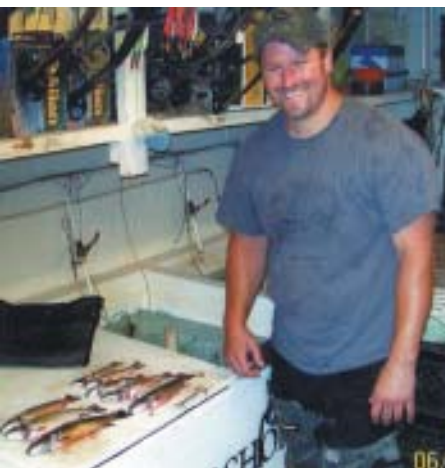
This Rustic Sport customer shows off a group catch of brookies caught on wigglers while fishing near Howard City.