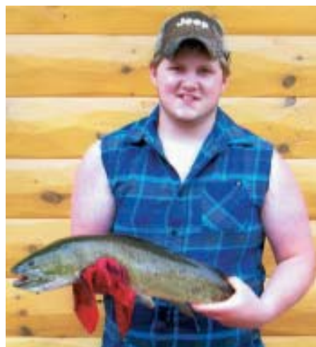
This happy Rustic Sport Shop customer caught this beauty near Howard City.

Six Lakes Hardware downtown Six Lakes 989.365.3000 This Ace Hardware store has whatever you may need to make that needed repair to your cabin, camper or boat. A huge inventory of items for rent are available to make