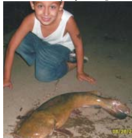
This very happy little man caught this nice Shovel at Tanglewood Pay Lake. He caught it on a kids fishing pole setup with 6lb test. Congratulations Big Guy!!

Wholesale Bait has been the Live Bait specialist since 1955. They are centrally located to all the Ohio, Kentucky and Indiana fishing Hot Spots. (It's worth the drive ). They have everything from wax worms