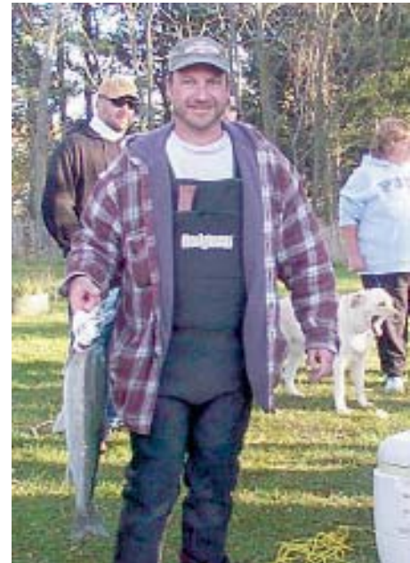
Another nice steelhead caught in the Manistee area.

Tom's Bait and Tackle reports nice catches of Walleye in lake Charlevoix in 16 to 21 foot of water. Tom said this is the farthest into Summer that he has seen the Walleyes hitting this hard. Reports of 34 Walleyes being caught in 3 1/2 hours was the normal day of fishing not the exception. The Walleyes were suspended in 8 to 10 foot off the bottom. #4 and #5 Blades in ALL colors were the lures of choice for the Big boys. The bass fishing was GOOD. Try fishing down the drops using Spinner baits, Curly Tail Spinners, Tube Jigs and Lead head jigs. Most of the bass were running between 14 and 20". The end of July was also producing some nice catches of Salmon in lake Charlevoix in 120 to 150 foot of water. They were hitting anything in BLUE !